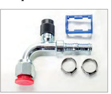
Fittings, classic or clip system