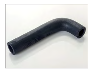
Water rubber pipe