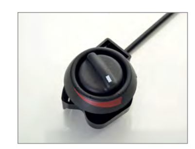
Many different cable controls