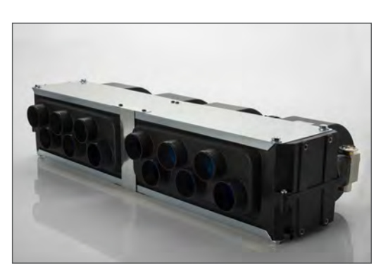
Evaporator Falkon Double Kombi