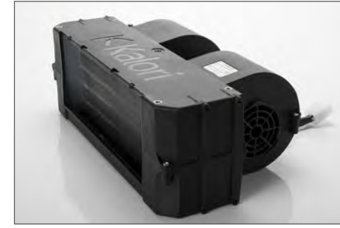
Evaporator combi Falkon