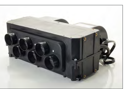
Electric heater Falkon Defrost 220 or 400v AC