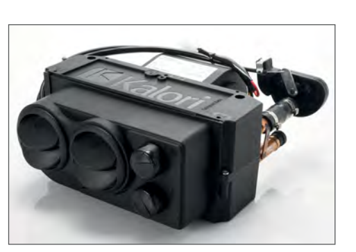
Heater or evaoprator Compact EVO2 FAI