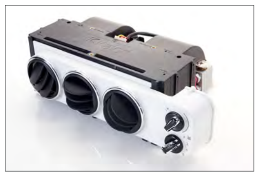
Evaporator combi Kool FAI an aesthetic innovation