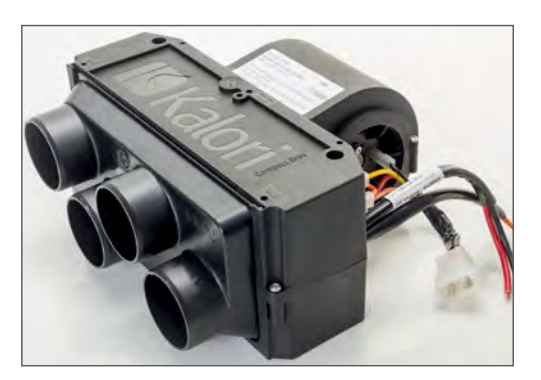
Heater Kelec EVO 1