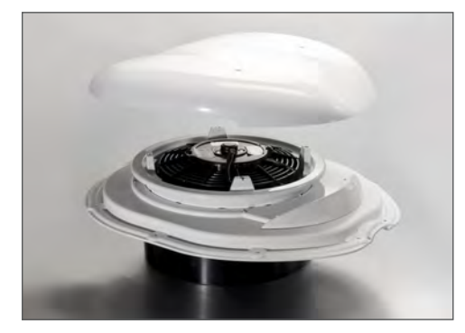
Roof ventilator : Design, efficiency and accessories for an easy installation

Our strong knowledge of this market ensures you to obtain a real comfort at a very competitive price.