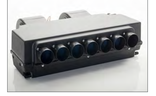
HVAC HK1 Kombi ED7 with specific ECM filter