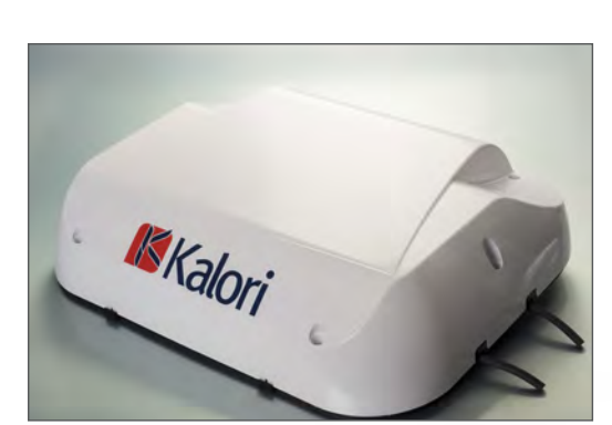
A/C or combi Klimatop: efficiency and gain of space in the cellule

A large part of the R&D power of Kalori is dedicated to innovation for ambulances and disabled person transportation,