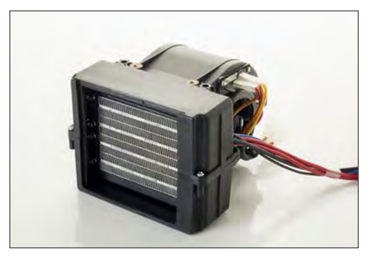
Electric Heater Alizé 2 Elec

Kalori has been one of the first manufacturers to offer electric heaters for those vehicles. The use of PTC resistance brings together the respect of the battery life, security and high-performance. Kalori's know-how about air conditioning systems permits to get an optimal comfort thanks to brushless motor semi-hermetic