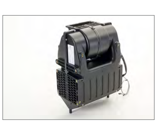
HVAC MKO Evaporator combinated with water or electric heater