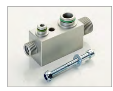
Adaptor The easiest way to install an additional evaporator