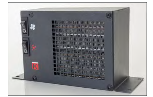
Heater Mini Kelec