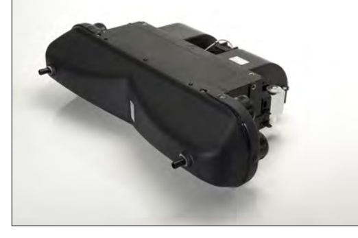
Falkon vertical Kombi AC 7.7 kW - H 10 kW