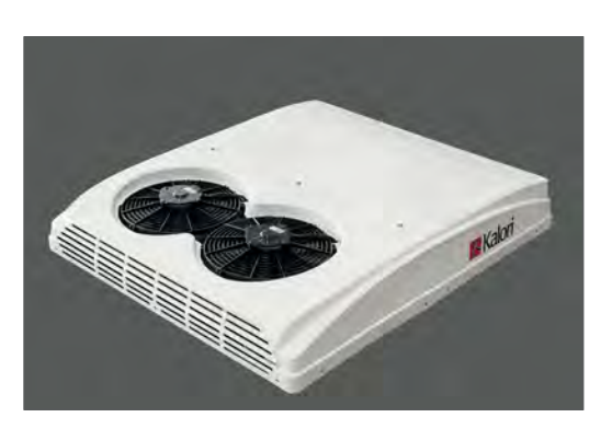
Rooftop unit RK14