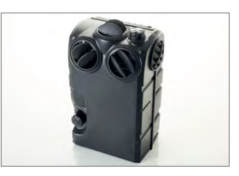
Heater Alizé 2 VI