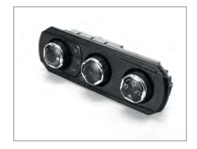
PCK control panel full auto or mechanic