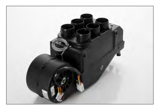
HVAC Kartel - AC 4.5 kW - H 6.1 kW