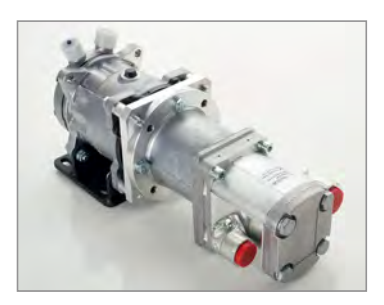
Compressors standard, hydraulic, electric