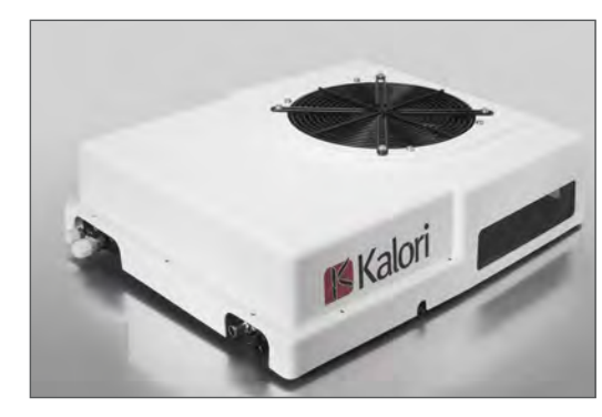
Roof top KANADA II Kombi AC 4.5 kW - H 6.5 kW | Including condenser and filter