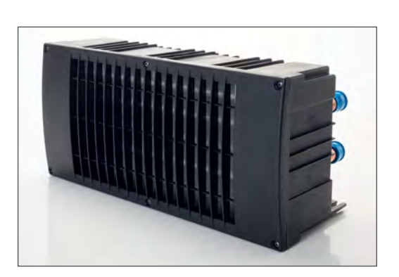
Heater Silencio 2