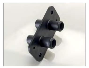
Straight bulkhead connector