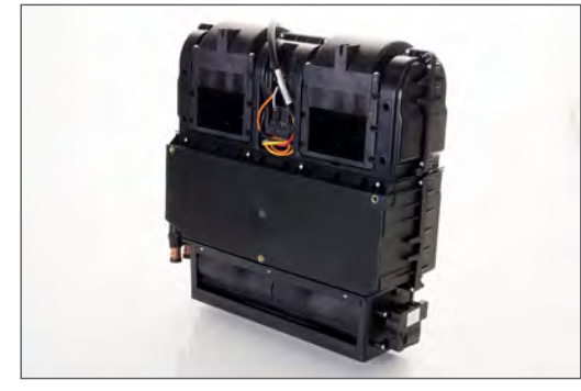
MK1 - AC 7 kW - H 7.8 kW