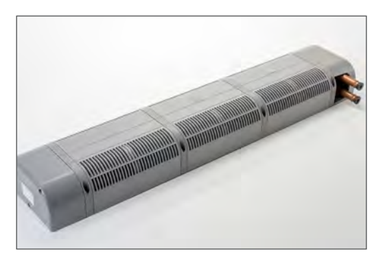
Heater Baikal : ventilated convector